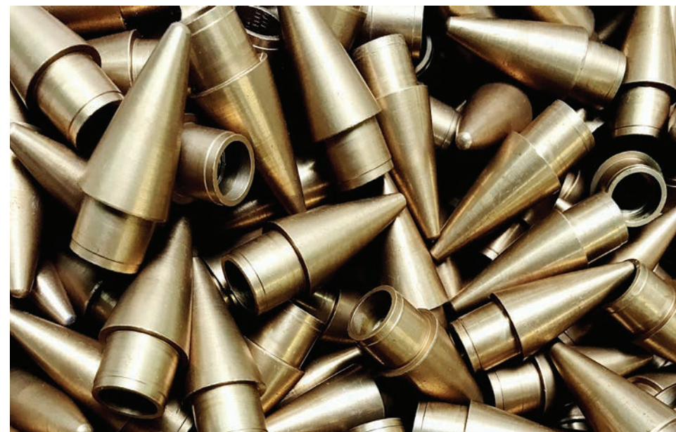
Chromate conversion coatings are used on aluminum alloys and castings for corrosion resistance and improved paint adhesion.

Serritella says CAC is happy to invest in new equipment for new programs that have a higher volume demand.